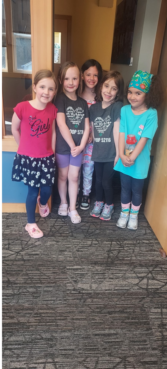
Just a few of our future leaders!