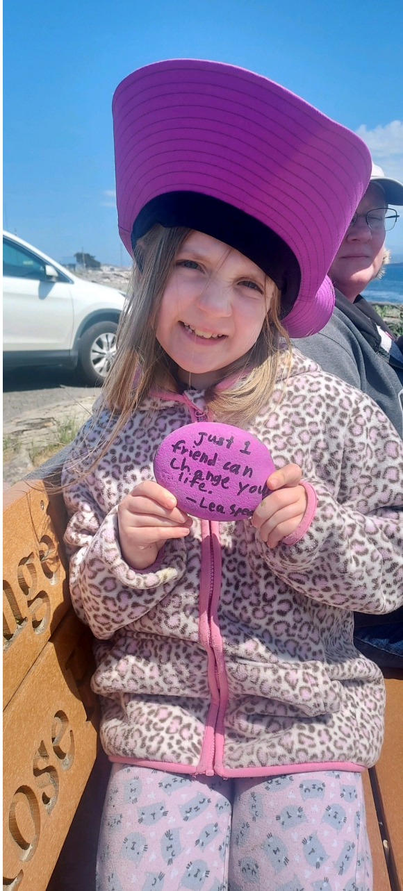
A sweet message shared by Marsha's lil pal @ ediz hook!