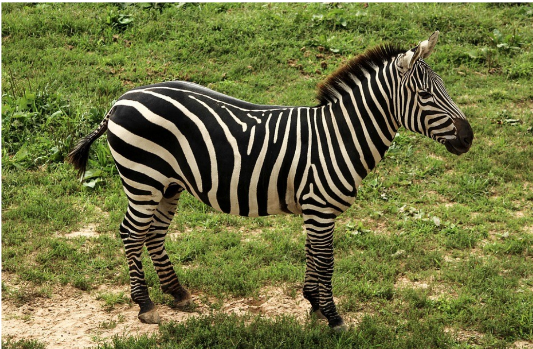
Zebra Sightings - Real or Imaginary